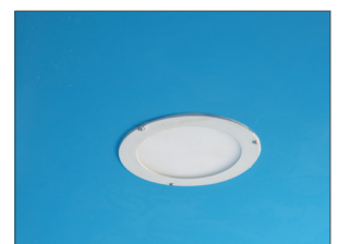
Internal recessed lights