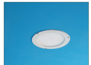
Internal recessed lights