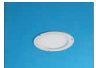
Internal recessed lights