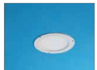
Internal recessed lights